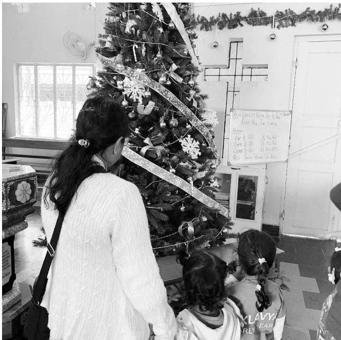
Admiring the Christmas tree