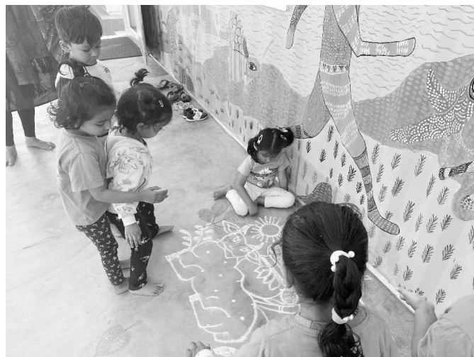
Observing the intricate kolam