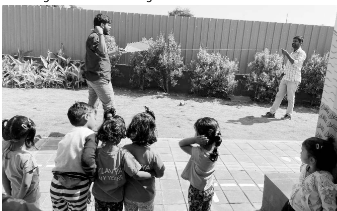
Intently watching expert kite flyers