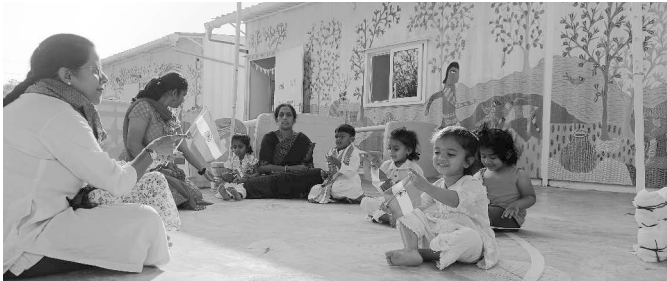
Learning about the Indian Flag