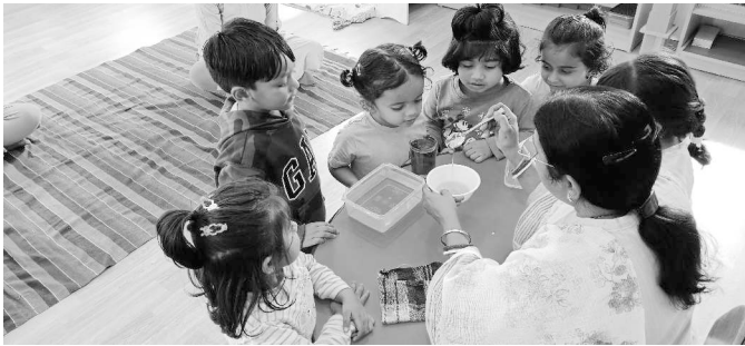
Curiosity and wonder