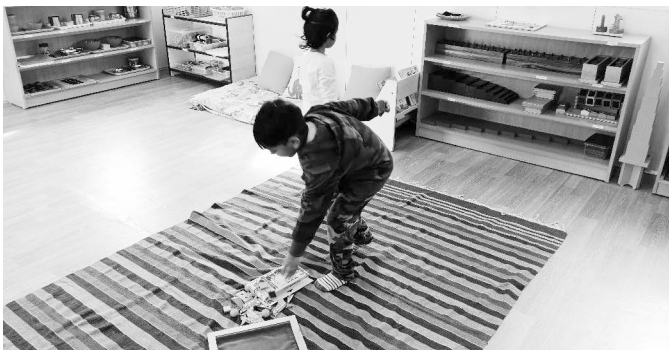
Collecting everything that's green