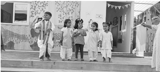
Beautiful poetry recitation