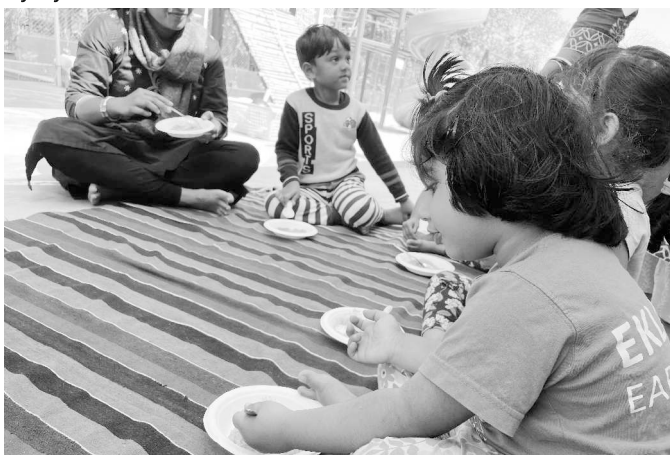
Relishing the delicious Pongal