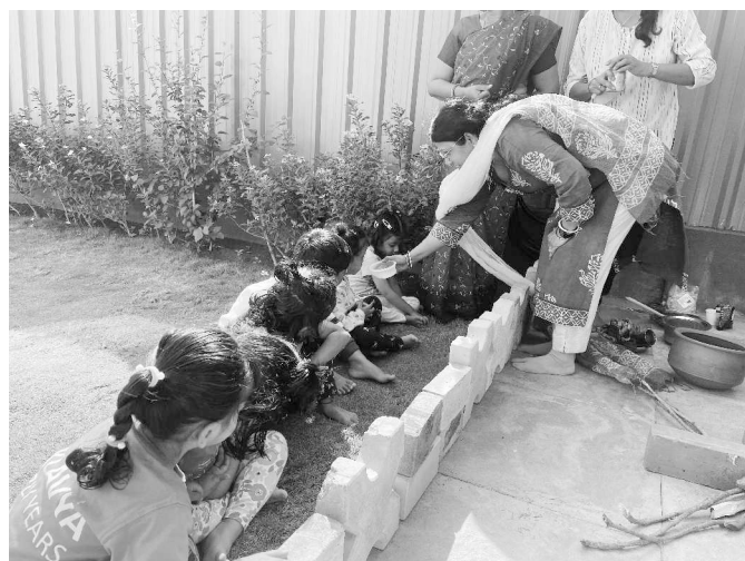
Tasting the sweet jaggery

26 January Republic Day - Children and educators celebrated Republic Day with great enthusiasm and excitement at Eklavya Early Years. The celebrations began with flag hoisting, followed by singing the National Anthem and then some lively performances by the children. First, they danced to नन्हा मुन्ना राही है and then recited a beautiful Hindi poem with accompanying actions. They also learnt about how to take care of the flag and to treat it with utmost respect. Finally, they heard a beautiful story about Gandhiji when he was a young boy and learnt that instead of adopting a tit for tat approach, they should be more large hearted, generous and forgiving.