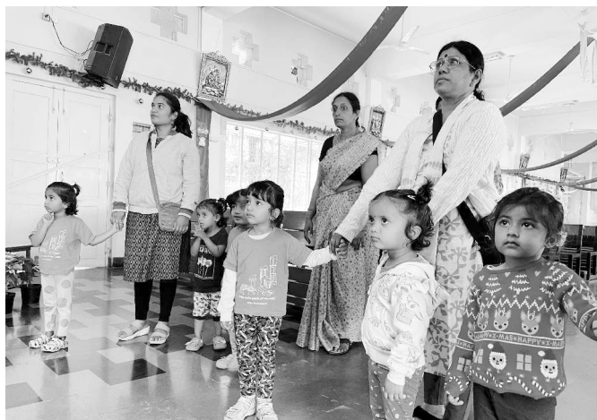
Observing Jesus Christ on the cross