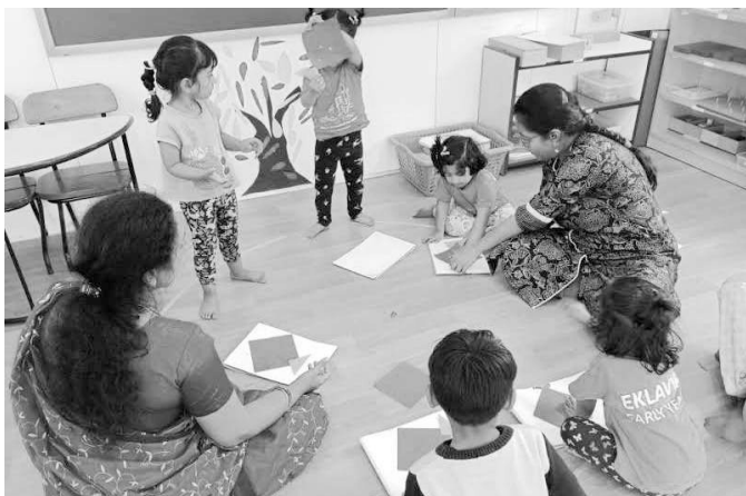
Making their own kites

During the day, they also admired the elaborate and intricate 'Kolam' design near the classrooms, made a kite and enjoyed watching the soaring kites flown by expert kite flyers. Finally, they played with kites of their own and enjoyed imitating the experts they had just seen.