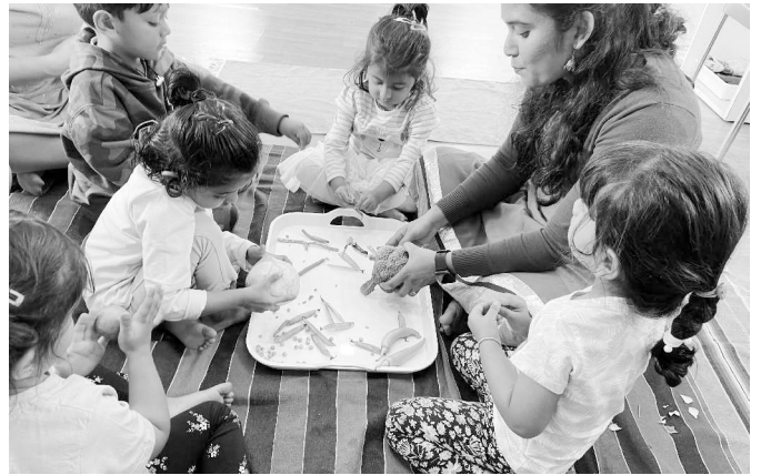
Exploring green vegetables

Block Room - Children of PG and KG enjoyed playing with the wooden materials and blocks during Block Room time this month. They created not only complex and large structures out of blocks but also imaginative and thoughtful ones. They also showed a greater openness to trying to playing with different kinds of wooden blocks, especially ones that were more challenging. Children also showed progress in their puzzle solving skills this month.