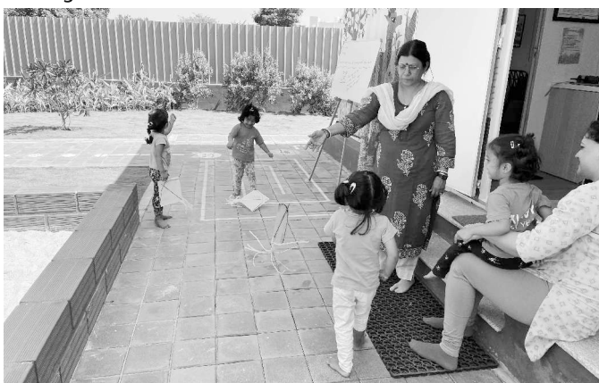
Fly fly little kite!