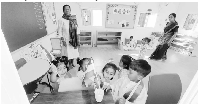
Carefully placing the flag in the classroom