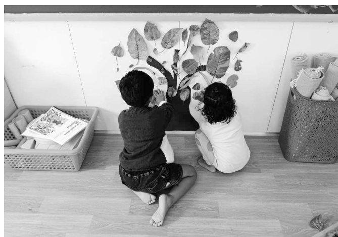
Creating a lush green tree

Finally, all the children did sponge painting with green colour in their drawing books, and curiously and wondrously watched a 'colour changing' science experiment.