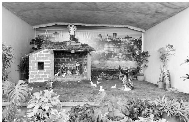
Enjoying the Nativity Scene