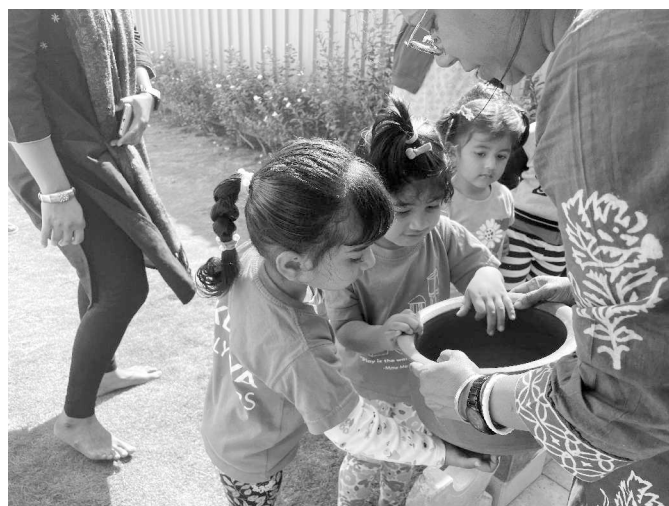
Observing the earthenware