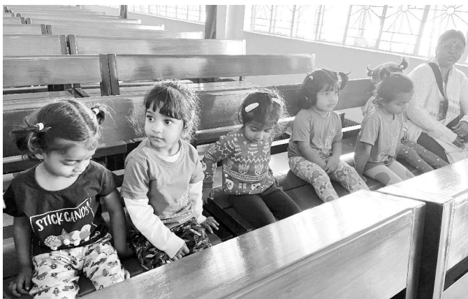
Listening intently to details about the church

5 Jan Field Visit to Church - This month, children visited the Our Lady of Vailankanni Church in Yelahanka. They keenly observed the idol of Mother Mary, Jesus Christ on the cross, the beautifully decorated Christmas Tree, and large Nativity Scene depicted in the Church. The children also learnt about altar and how devotees pray in the Church.