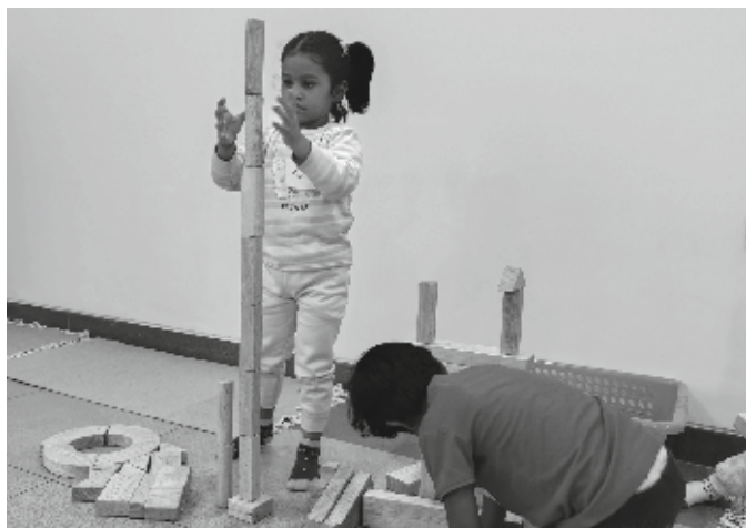
30 Nov, Little Explorers Event : On 30 Nov, we invited children aged 2-6 for a special 'Little Explorers' event. Children worked with our innovative wooden blocks, did marble painting, did science experiments and much more.