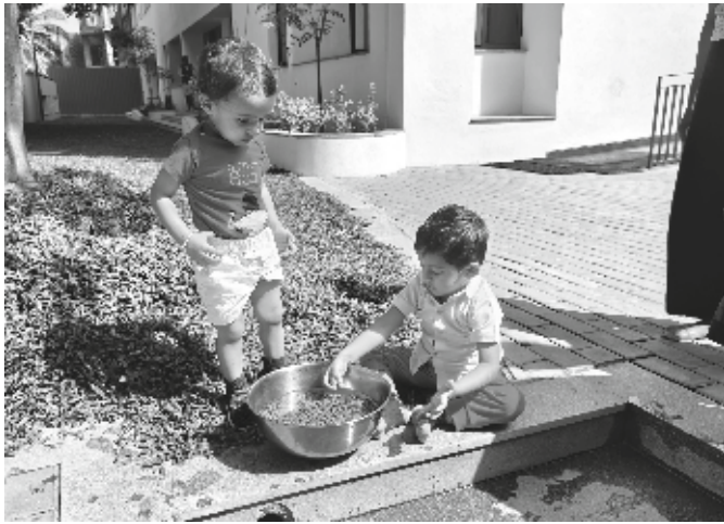
Observing the soaked chana