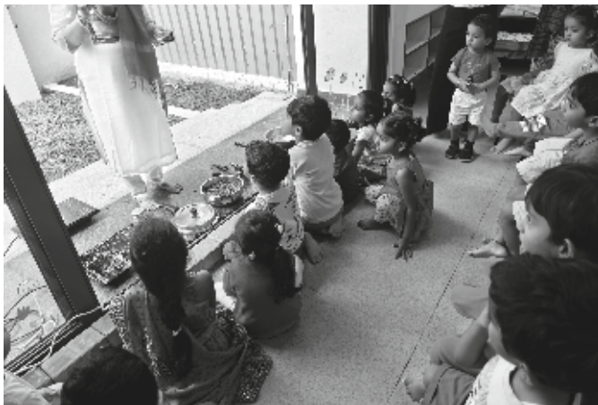
It's time to start cooking