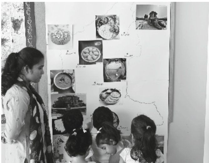
Learning about the delicious food of Karnataka

13 Nov, Yellow/Purple Day : Children of PG celebrated Yellow Day while KG students celebrated Purple Day on 28 August. Children came to school wearing yellow or purple and in their respective classrooms collected all things that were yellow or purple. PG children also sang a yellow song' and enjoyed painting a bird yellow. KG children observed different kinds of purple vegetables and objects, and then enjoyed hand painting with purple. After a lot of trial and error, the children figured out which two colours when mixed produce purple.