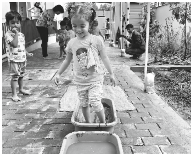
Enjoying the squishiness of mud

15 Nov, Guru Nanak Jayanti : Children of PG and KG learnt about the Founder of Sikhism, Guru Nanakji. They not only learnt about his life and childhood but also about how he valued service and generosity above all else.