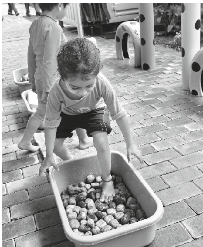
"Oooh, the stones feel hard under my feet."