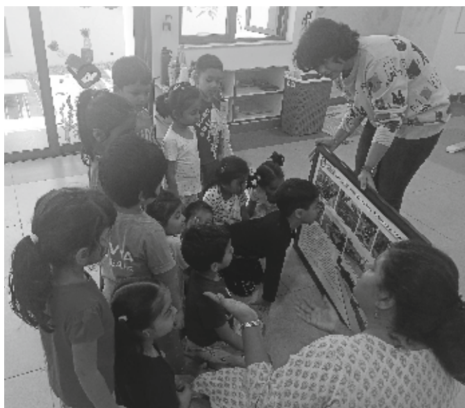
Learning about our school