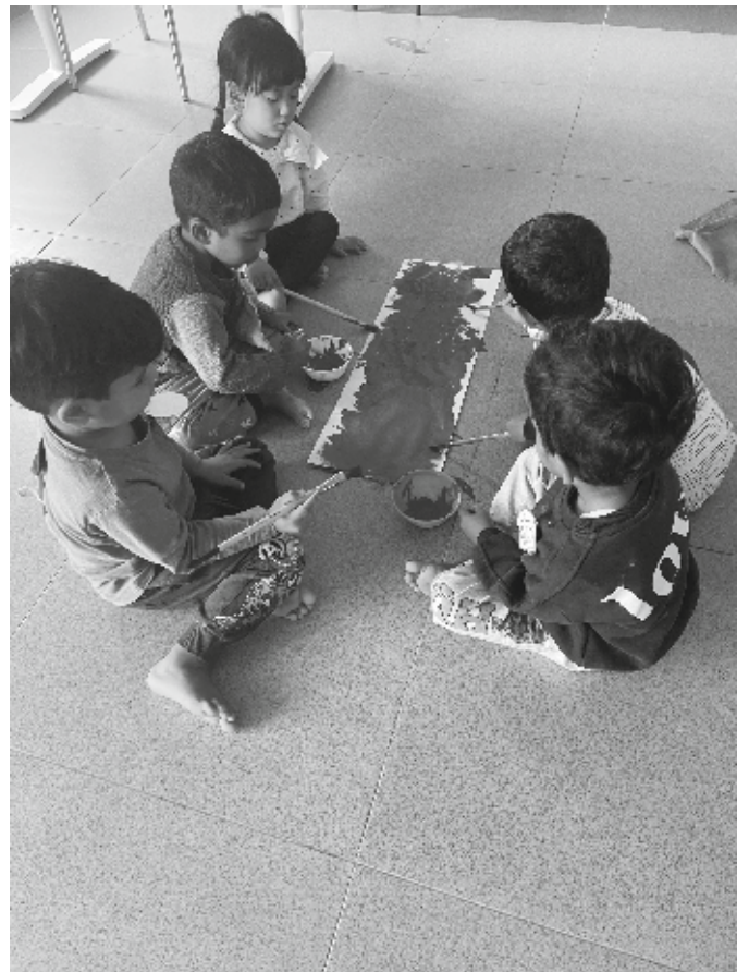
Painting it red for the Karnataka flag