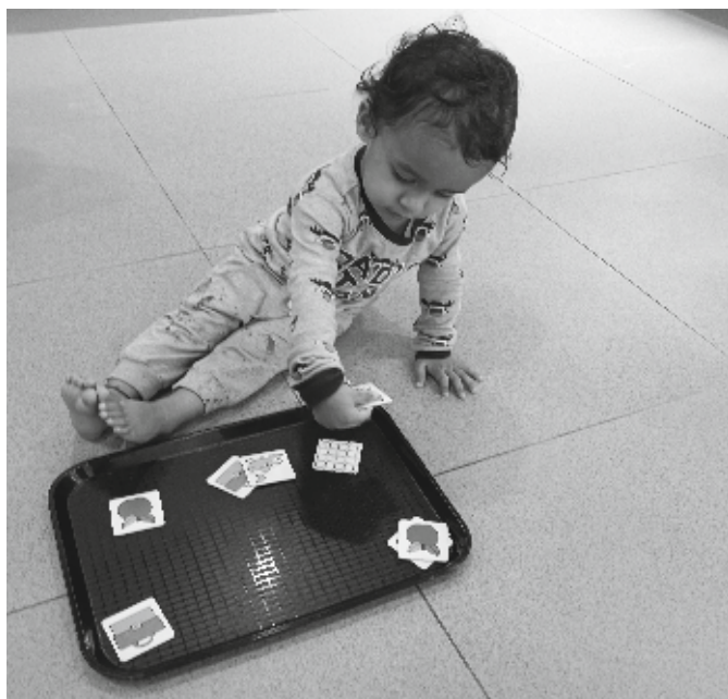
Deep in concentration