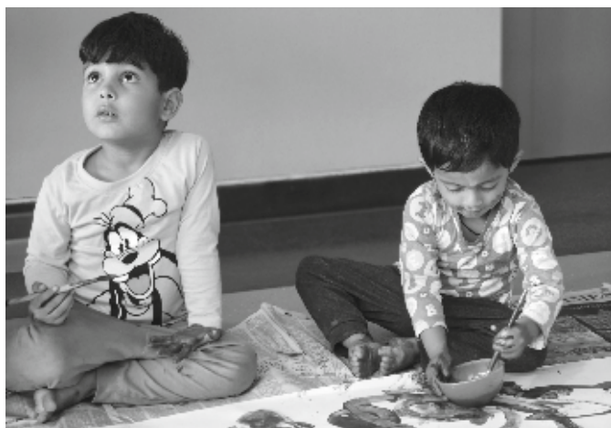
Relishing the feel of paint