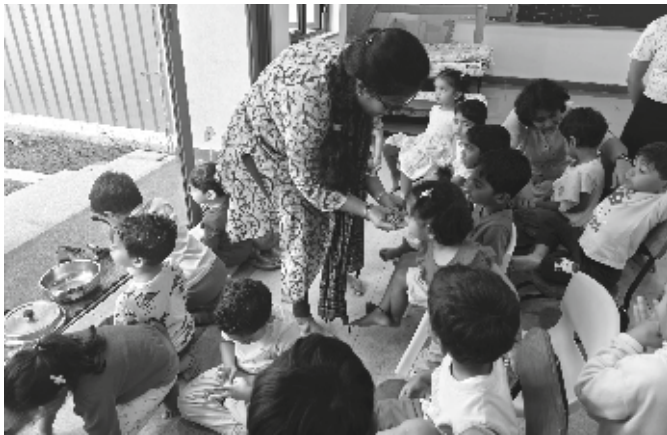
Smelling and observing the ingredients of Kadale Usli