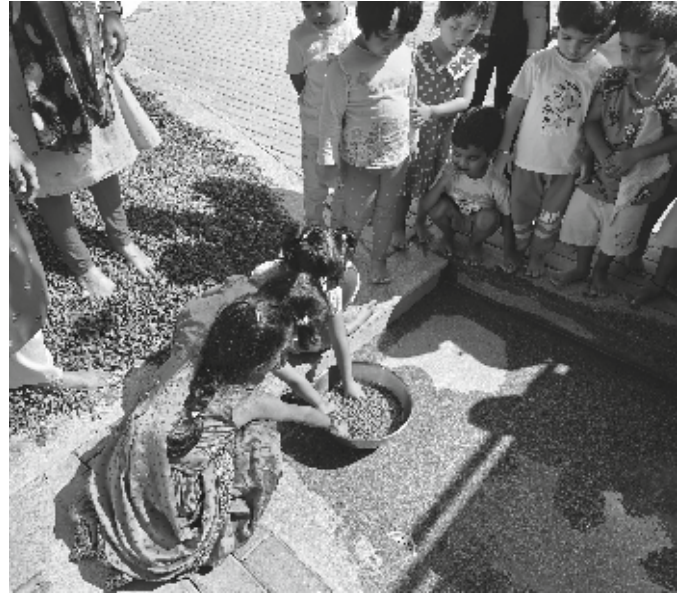
Washing the chana for Kadale Usli

Finally, they watched the educators preparing Kadale Usli, a healthy snack in Karnataka. Children relished the Kadle Usli and enjoyed celebrating Karnataka Rajyotsava.