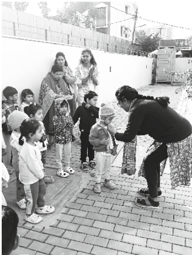
GMS - Jumping : - Children of PG enjoyed the activity of jumping this month. They were thrilled to jump as high as they could and in the process, they strengthened their leg muscles, core and body balance.