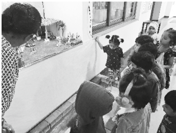
Observing the village scene

Republic Day celebrations : - Children of TG, PG and KG enjoyed celebrating our 76th Republic Day on Sat, 25 Jan. Children first gathered for the flag unfurling and the singing of the national anthem. Next they put up beautiful performances - singing, dancing and theater - in front of all their friends and educators. They had practiced for many days and had put in a lot of effort. All the children were confident, articulate and graceful.