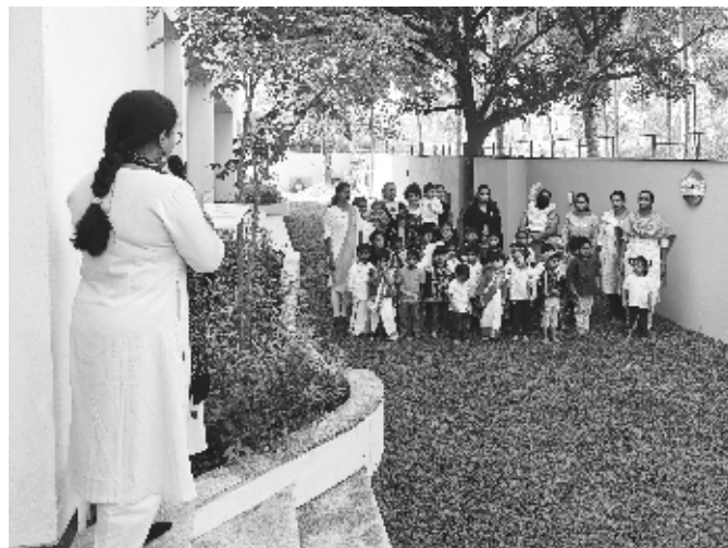
Standing in attention for Jana Gana Mana