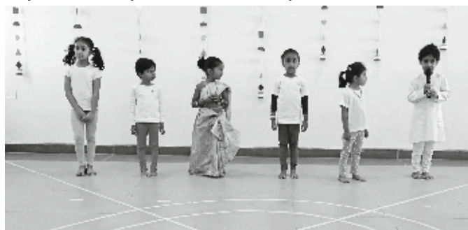
Skit on duties and responsibilities