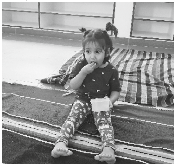
Relishing Ellu Bella