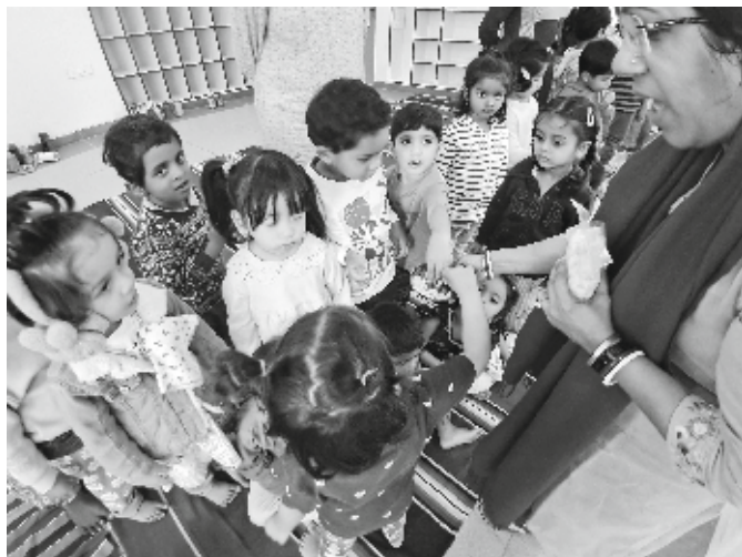
Tasting dried coconut

14 Jan, Makara Sankranthi : - This Makara Sankranthi, children of PG, KG and TG prepared and relished Ellu Bella, a sweet Karnataka special snack. Children were shown each ingredient. They were eager to taste them as well and especially enjoyed the jaggery and dried coconut. During Circle Time they learnt about why and how Makara Sankranthi is celebrated in different parts of the country. Children were also shown a beautiful display of a village scene in school. They were fascinated by the display and would often gather at the display and talk to each other about it this month. Finally, children enjoyed learning how to fly kites this month. They were thrilled to see the kites soar in the sky and feel the tug and tension in the string.