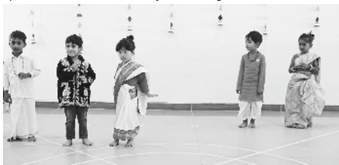
Unity in diversity