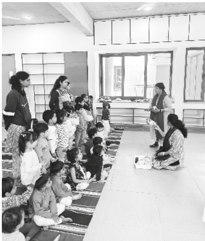
Watching how Ellu Bella is prepared