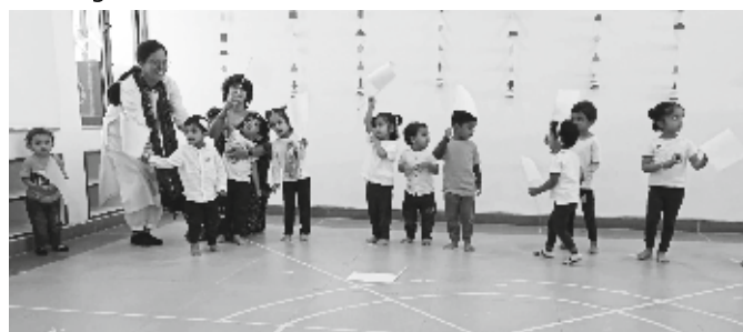
Waving the flag of peace