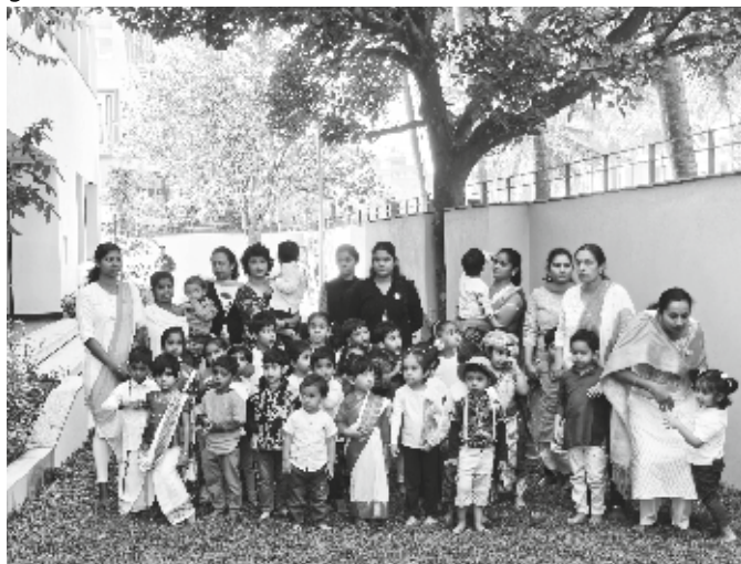
Ready for Republic Day

Republic Day celebrations : - Children of TG, PG and KG enjoyed celebrating our 76th Republic Day on Sat, 25 Jan. Children first gathered for the flag unfurling and the singing of the national anthem. Next they put up beautiful performances - singing, dancing and theater - in front of all their friends and educators. They had practiced for many days and had put in a lot of effort. All the children were confident, articulate and graceful.