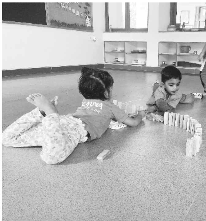
Build and enjoy