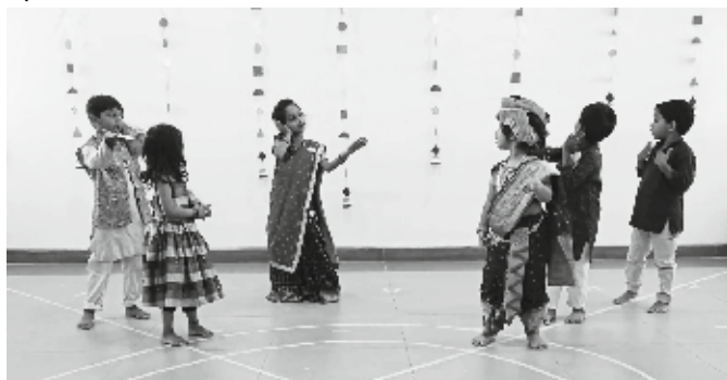
Dancing with grace