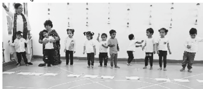
हम होंगे कामयाब