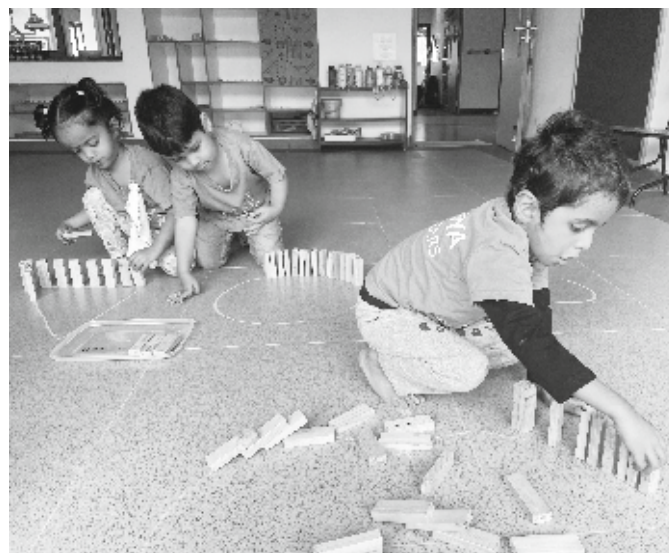
Work with dominoes