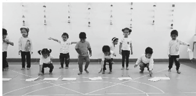
Dancing to their own tune