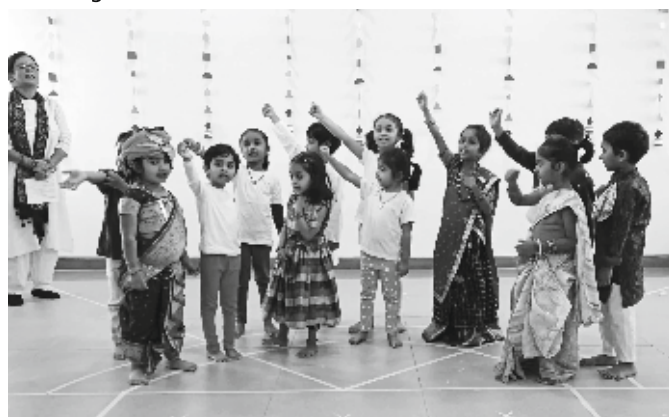
हम हिन्दुस्तानी !