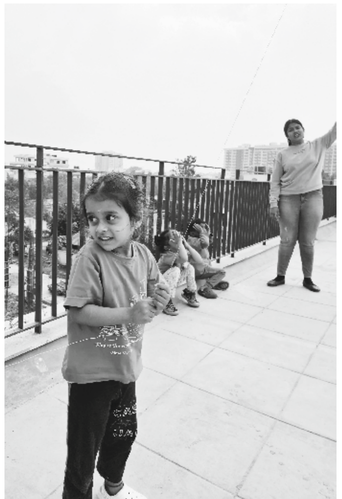
Shall I tug at the string?