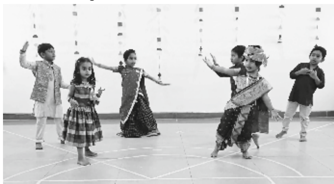
ऐसा देस है मेरा