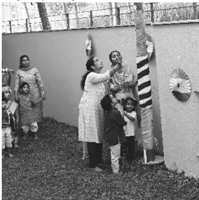
Unfurling of the Indian flag