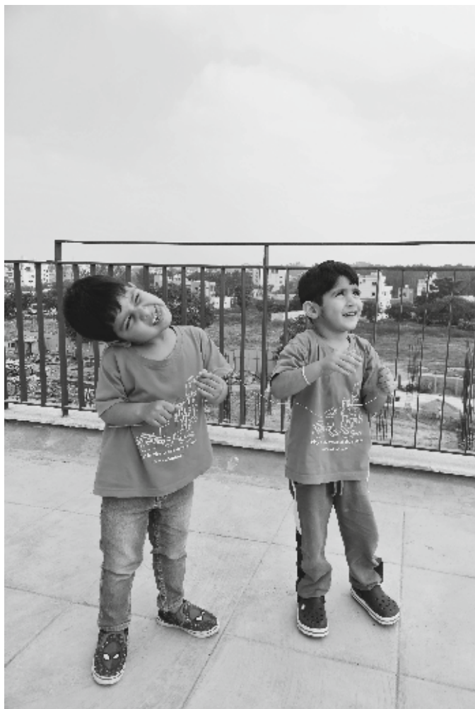
Is it really flying that high?