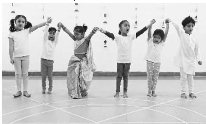
"Enter to learn, go forth to serve"