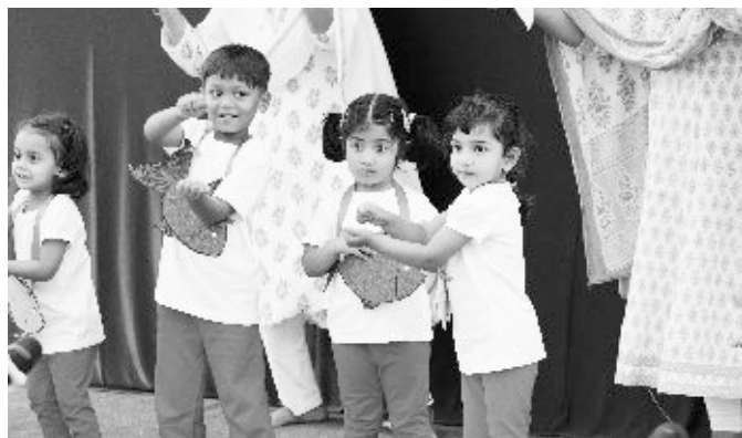
Baby shark do do do...