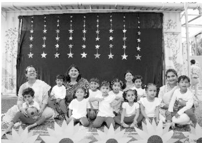
Ready for the BIG DAY!