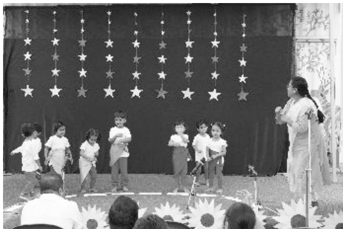
Who can go faster?