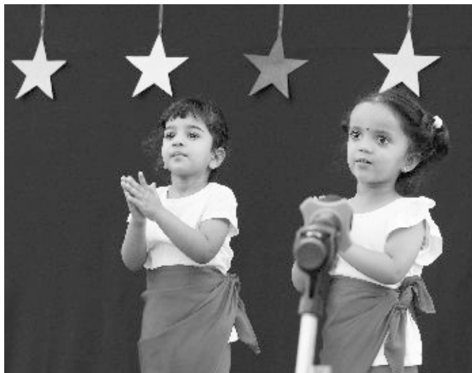
Earnest faces, folded hands