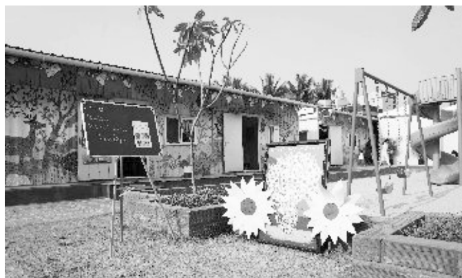
Our beautiful campus

Educators performed a beautiful rendition of 'आ चल के तुझे', followed by the singing of the Eklavya Song.