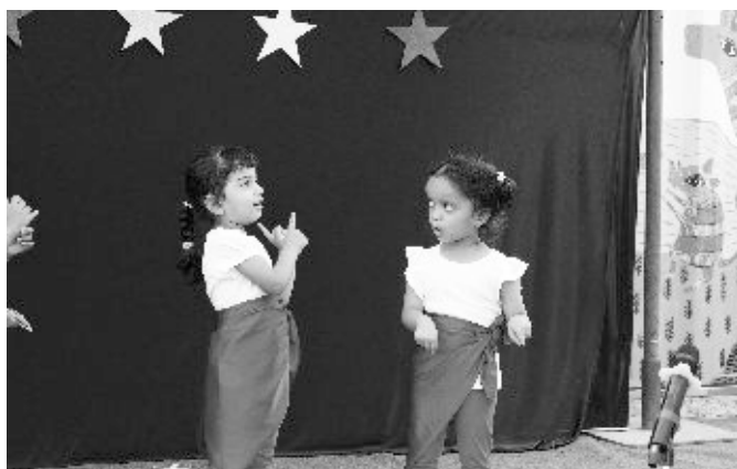
Expressive & confident