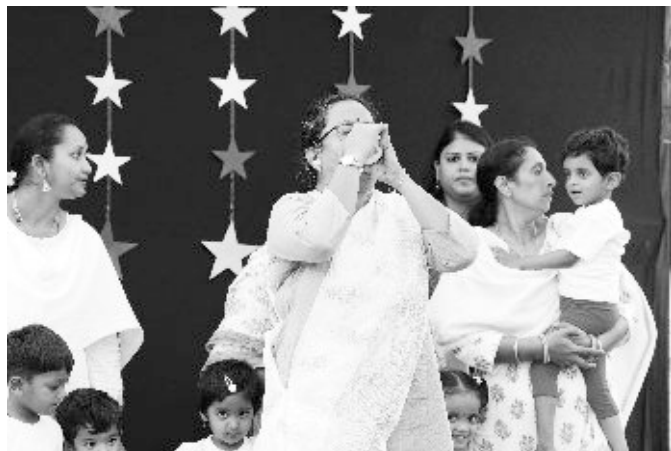
An auspicious start