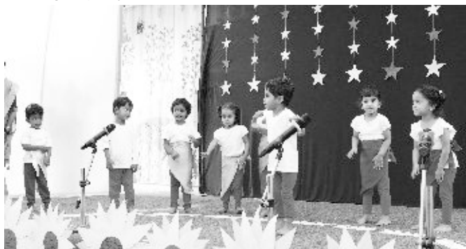
Ram Sam Sam