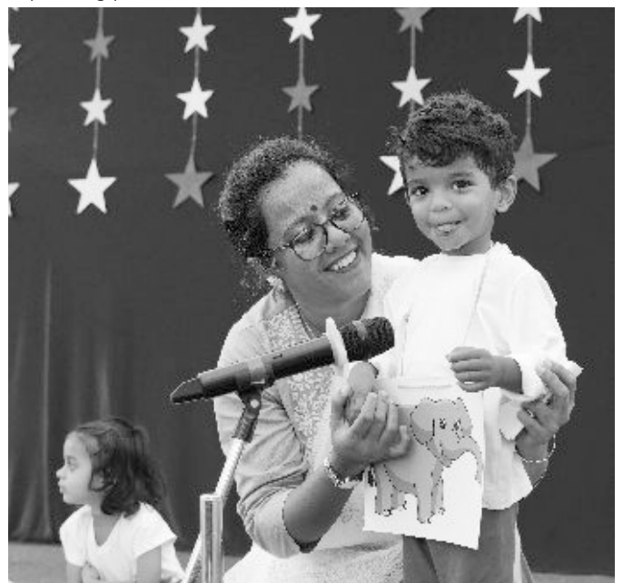
There's my Mamma & Papa !