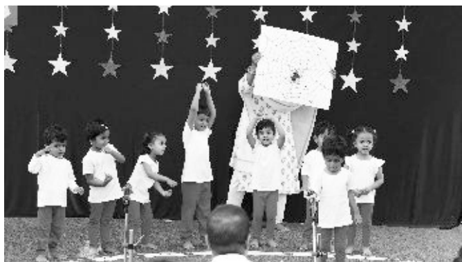
Incy Wincy with a Hindi twist