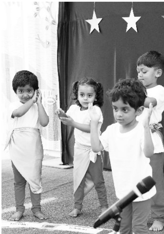
It's time for a jig!